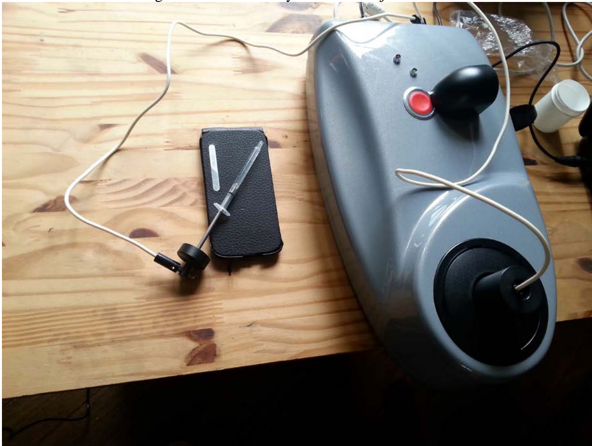
GDV Machine Recording Bio-Photon Activity of Water Subject to Cell Phone

First, a syringe is filled with medical-grade water that has a similar composition to human plasma*. The same syringe of water is used in all 3 consecutive tests. Each dot on the graph represents a 30 sec increment and the duration of each test is approximately 15 minutes. The GDV machine** is used in all the 3 samples to measure the bio-photon activity*** of the water. The test was conducted in an EMR protected laboratory. The cell phone used in this test is an Android smartphone. This test was conducted using the 2 nd Generation of Biotech Adapters.